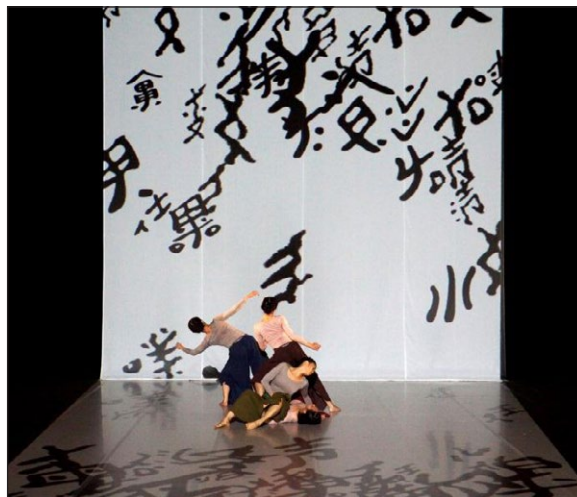
Figure 3: In Nu Shu the rain of characters is an emblematic symbol holding personal significance. Dancer: Tzu-Ying Lin, Tzu-Chun Lin, Ssu-Ching Lei, Ya-Ting Tsai. Programing design: Chia-Hsiang Lee. Lighting design: Chun-Chieh Lee. Xinzhuang Culture and Arts Center performing hall, New Taipei City, Taiwan, November 2014.

into an apotheosis of emotional graphemes: the whole background is engulfed by the color of black ink ( Figure 4 ).