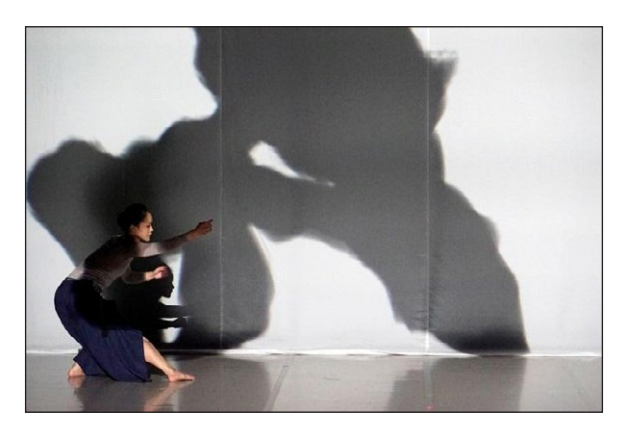
Figure 2: The dancer's movements and positions are captured by Kinect sensors which instantly write the character strokes with an ink marker. Dancer Tzu-Ying Lin. Programing design: Chia-Hsiang Lee. Xinzhuang Culture and Arts Center performing hall, New Taipei City, Taiwan, November 2014.