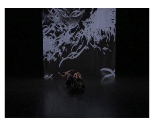
Figure 5: The Nu Shu characters flying in the dark are an emblematic symbol, and hold personal significance. Dancer: Tzu-Ying Lin, Tzu-Chun Lin, Ssu-Ching Lei, Ya-Ting Tsai. Video screenshot: Nu Shu GPS.