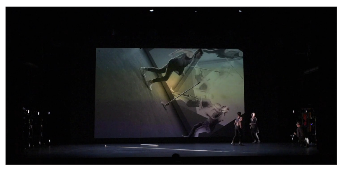
Figure 4: Arianna Marcoulides, Rania Glymitza, and Savvas Baltzis on stage and on screen. 'A Line, A Gaze, A Horizon' performance at Rialto Theatre, Limassol, Cyprus, September 22<sup>nd</sup>, 2022. Screenshot of recording.

The two dancers continue to jump in sync but the camera work and the videographer's placement and focus choices in relation to the dancers creates a digital landscape that distorts the simple jumps of the two dancers facing each other. They jump in perfect rhythmic unison creating a soundscore through their trainers hitting the floor and their laboured breathing. But the visual rhythm of their physical and aural movement