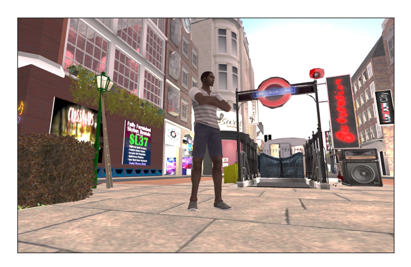
Figure 1: Lock Weatherwax in Second Life.

a metaverse. A metaverse then, can be seen as kimospheric online integrated platform, where the avatars different users can participate in a virtual Community. This similar to my Avatar, Lock Weatherwax pictured here on the left, in a virtual London situated in Second Life. The potential themes of