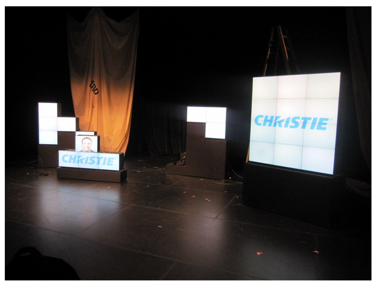
Production set with four arrays of MicroTiles, Lower Ossington Theatre, Toronto

In the process, the performers introduced the real audience of invited theatre entrepreneurs, Artistic Directors, Technical Directors, and post-secondary theatre educators to some of the MicroTiles' visual display properties. The story involved a less than competent male Technician (live) who finds a female Presenter (pre-recorded) trapped inside the bottom row of MicroTiles in one of the four arrays. He helps to 'free' her from her entrapment by adding more MicroTiles on top of the bottom row until she is able to step out of her pre-recorded existence (using some conventional theatrical sleight-of-hand) into her live presence on stage. Following some arguments about the arrangement of the MicroTiles, their technical specificities, and physical characteristics, the two swap places as the Technician (now pre-recorded) accommodates himself comfortably inside the MicroTiles while the Presenter (now live onstage) assumes full control over the MicroTiles and shows off their technical attributes.