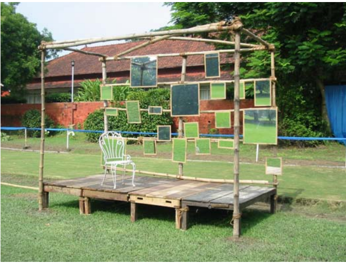
The City of Reflection