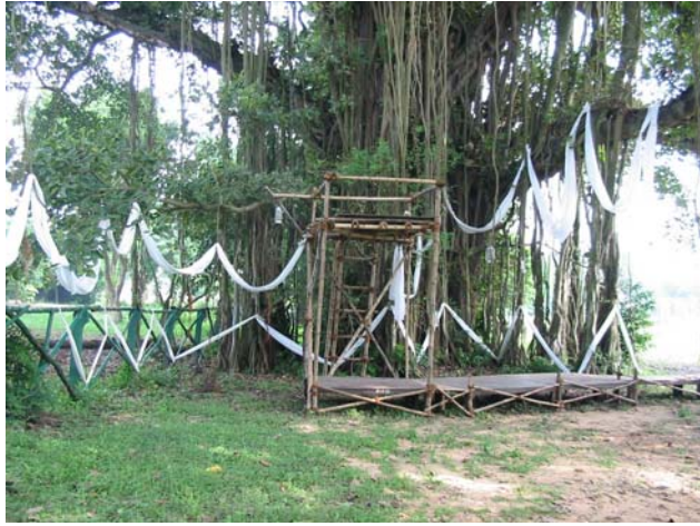
City of (Under construction)