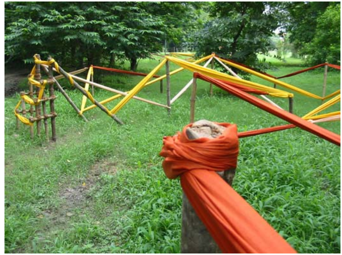
The Silk Route – Memory of a Journey

Forget the clinical heads, mids and shins lighting dancers on a polymer dance floor with, albeit brilliant, displays of technique. Take a risk, dance in an environment that taps into the soul of the dancer, no, that's been done; let space, body and heart conjoin in the dance of awareness, the dance of honesty – the dance of realisation.