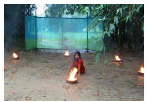
Rehearsal in the City of Desire

I chose and area with an arch of bamboo to form the backdrop, into which I would put a silk screen. Through the screen, naked flames would illuminate the silk, enhance its colours and the shadows of dancers performing between the flames and the screen project unpredictable patterns. The dancers would break through the screen to join another dancer already waiting in the space. This space was, defined by a series of terracotta bowls, each with a small fire burning in it, designed to go out sequentially so that by the end of the performance the fires one by one had extinguished. As the performance ended the last flame died.