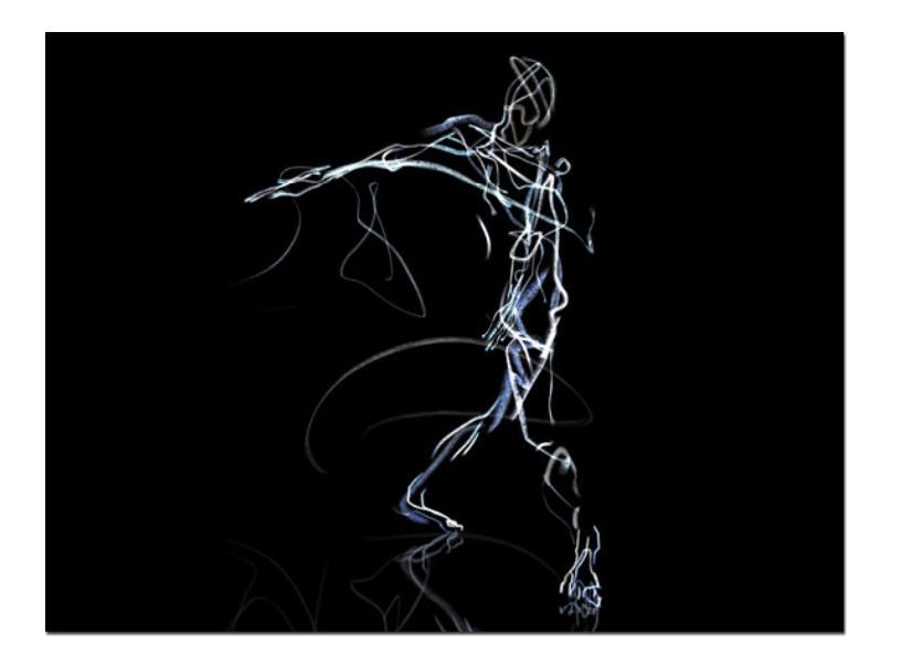
Still 3 from Ghostcatching

This recalled an issue raised by Novak who argued that, as our technological thinking progresses, our perception of time, space and motion need to be able to conceptualise new planes and states of experience. It seems that our perception of moving will have to evolve in order for us to understand what could perhaps be called a new disembodied bodily experience. Theoretically, I can see how this might work. However, whilst watching certain presentations and demonstrations, my desire to hang on to the aesthetics' of the live dancing body still seemed to grate with the projected virtual body. The ability to perceive and comprehend the live and virtual body all in the same perceptual field seems to be problematic because each one seems to become an adjunct to the other. This in turn makes it difficult to perceive the event holistically as one piece of work. For somebody like Jones, the very fact that the physicality had changed might have predetermined that the project would fail. However, it was clear that Jones and Eshkar had embraced a 'transvergence' and had managed to find a new context for making and perceiving new dimensions of quality, space and form adding another facet to