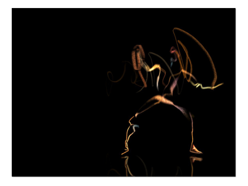
Still 2 from Ghostcatching © 1999 Jones, Kaiser, Eschkar

Jones found that he needed to conceptualise the body as a source for evolving images that don't replicate the physicality of the body, but allow an image to form on the back of physical motion, pacing, flow and dimension.