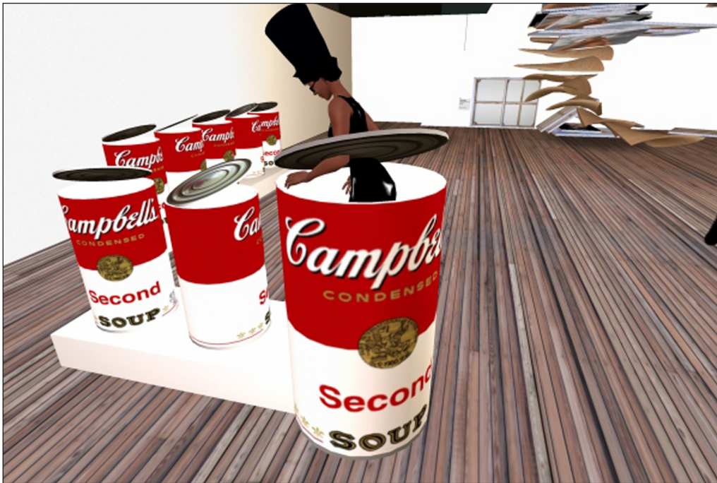
Figure 3: Babeli, Gazira, Second Soup . You love pop art, but pop art hates you. Scripted cans, still from video. May 2006 © the artist. Source: http://gazirababeli.com/secondsoup.php .

Towards the end of the 2010s, access to the platform required a computer with relatively high hardware and software system requirements. Once logged in, the user experience for SL residents was (and still is) characterised by customising their avatars for surreal but routine activities. For the first time, native functionalities focused on the possibility to customise the user's avatar easily; then, using WASD keys, it was possible to explore the environments with no purpose and interact according to verbal, aesthetic-symbolic, musical and movement languages borrowed from real life (RL), but also invented, jargon. Being open source, the possibilities of interaction and participation in the platform's development quickly spread through coding and compatibility with external software, virtual objects, gadgets, entire buildings and cities.