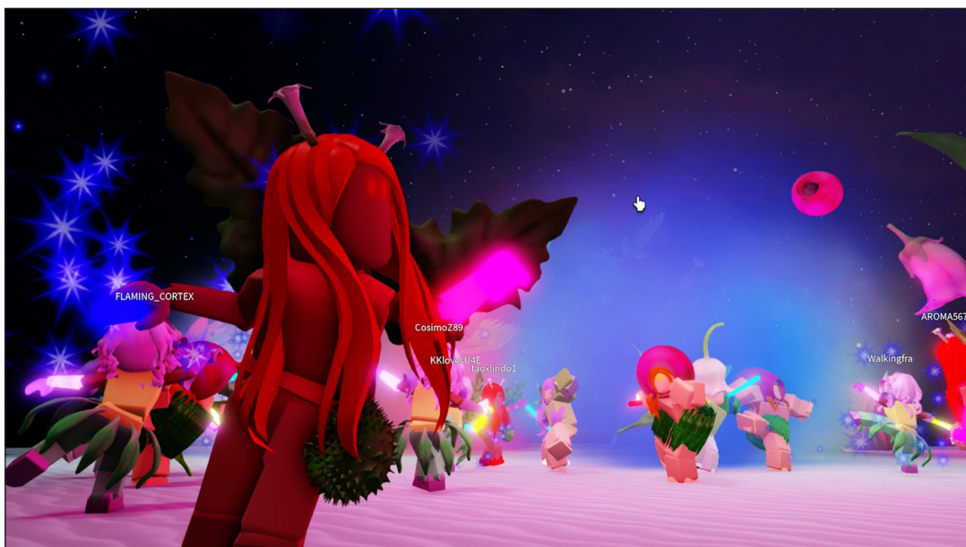
Figure 4: Kard, Kamilia, Toxic Garden – Dance Dance Dance . Digital performance on Roblox, still from video. © the artist. Source: https://not.neroeditions.com/ballare-nel-metaverso/ .

According to the analysis of critics and curators who have inhabited the platform and analysed the community (Flimflam et al., 2007), SL's UX can be said to have brought each inhabitant closer to being a performer – Dadaist, Situationist – by the simple fact of inhabiting a collective virtual space and interacting with it through instructions/codes that were displayed and interpreted into objects, images, movements—acollectivehappening, simultaneousandinreal-time. Intheintervening years, the UX of SL has become the mental model for most of the social platforms of mass interaction.