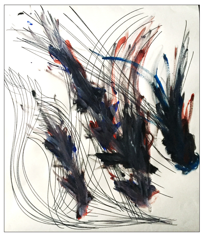
Figure 4: An example of a Figure by the Author (2017). Photo: The Author. Reproduced with permission of the Author.