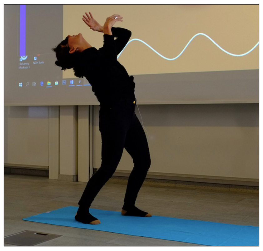
Figure 1: Dancer, the Author in Deep Flow at the Symposium on Digital Urbanism, Blekinge Institute of Technology, Karlshamn, Sweden, Nov 14, 2019. Photo: Daniel Spikol. Reproduced with permission of the photographer.

Deep Flow therefore synchronises states of flow, between the physiological, the implicit, and resonant states of awareness. By looking inwardly, directing one's attention to the bodily senses, sensations and feelings, internal visualisations, and perceptions begin to materialise. Internal visualisations of colour, memories and emotions emerge in your mind's eye; your body sometimes feels like it is melting into the world around you, and you are moving in a thick viscous environment. This fosters a state of calm and flowing relations between subjectivity, the felt-sense, the sensorimotor system, the ANS, the fascia, the kinaesthetic, proprioceptive, and sensorimotor systems. Attending to every shift of experiencing the body and mind are experienced as a unified whole. The slow deep breathing stimulates the parasympathetic nervous system which lowers heart rate and increases HRV making you feel relaxed, focused, calm and in a state of flow (Figure 1).