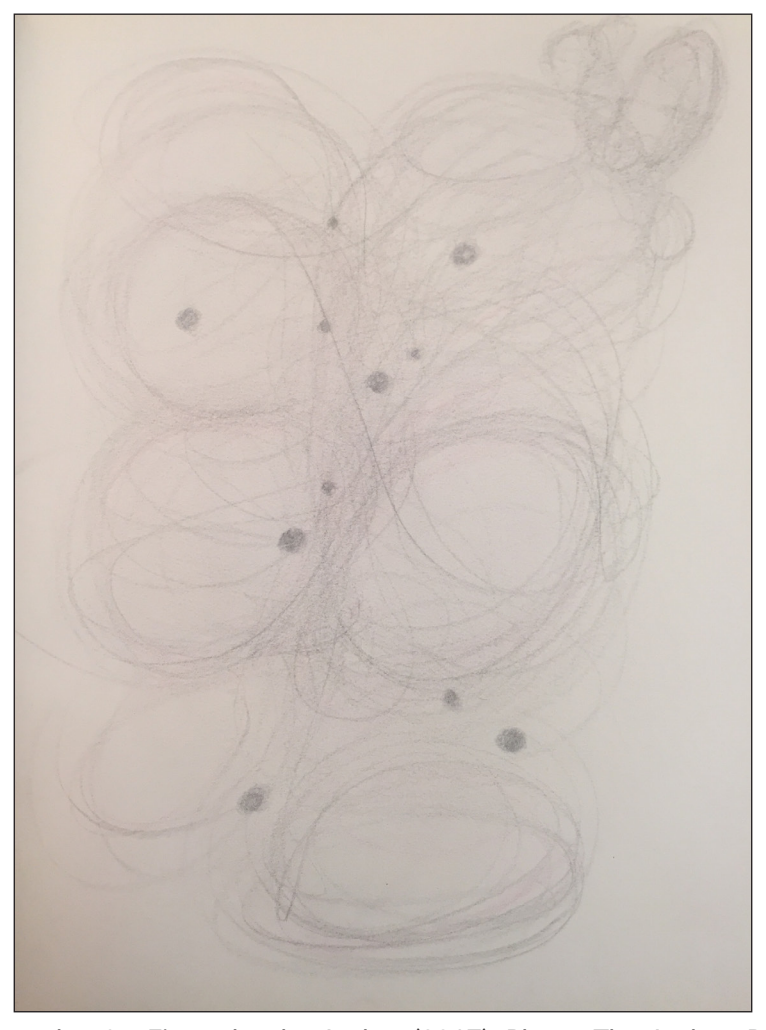
Figure 3: An example of a Figure by the Author (2017). Photo: The Author. Reproduced with permission of the Author.

This was derived from Nikolaus Gansterer (2017) methods of figuring . According to Gansterer, figuring starts in the body of the practitioner. One needs to firstly pay attention to the experiential shifts, intensities, sensations, or feelings in the body before they are represented and made visible externally through drawing or painting. When aware of this figuring , one then composes or creates figures , that are spontaneous drawings-paintings ( Figures 3 & 4 ) not controlled by a drawer's cognitive abilities but through a body-mind relation. This figuring-figures process may be seen as being symbiotic and reciprocal, a Möbius strip as 'figuring gives rise to figures , whilst they attempt to activate the figures , create the conditions for (further) figuring' (Gansterer et al. , 2017, p. p. 75).