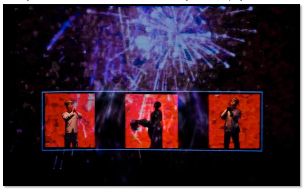
Figure 3: 'Lovemaking Scene' from 6 Degrees Below the Horizon.

An example of this in Tales from the Bar of Lost Souls is the 'Love making' scene, which comes after the protagonist meets his future wife, a local singer in one of the taverns; after a bar fight with local sailors he is injured and she decides to take him in for the night and attend to his wounds. They fall for each other and end up in bed. In this scene the live performance is structured through three vignettes: the central one showing the two lovers and two side frames showing sailors praying.