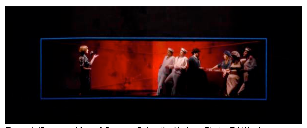
Figure 4: 'Bar scene' from 6 Degrees Below the Horizon.

Apart from being a crucial component in the intermedial deconstruction, the soundtrack triggers a (syn)aesthetic spectatorship by eliciting a transgressive stance towards some of the melodramatic tropes in the piece. One of these tropes is the idyllic relationship between the sailor and the singer. The relationship starts when the sailor hears her sing Eric Satie's Je Te Veux . This iconic song sparks their relationship. Using this piece of music and its theme as the initial emotive underscore fulfills many cultural expectations associated with romance since it is quite clearly a love song to begin with. It is also harmonically 'clean' and stable as a musical construction, aptly underscoring their initial, idyllic encounter.