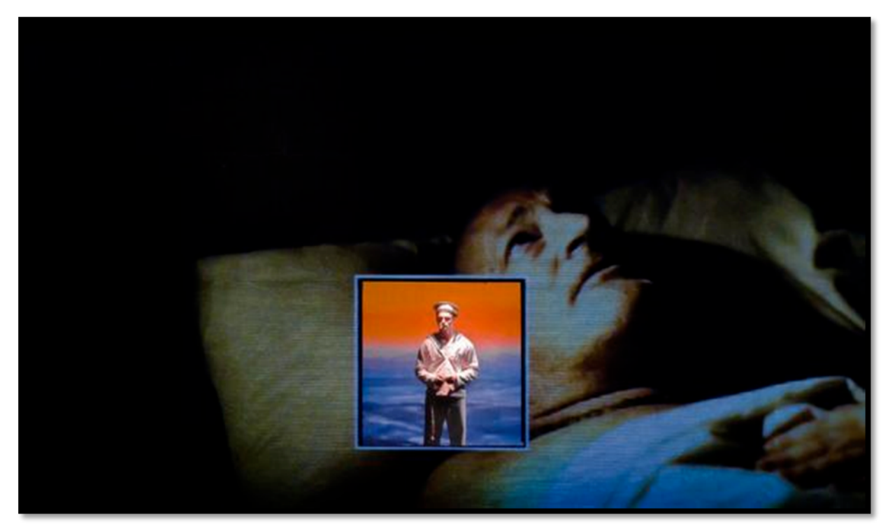
Figure 1: 'Prologue' from 6 Degrees Below the Horizon.

This theatrical deconstruction of cinematic aesthetics offered possibilities of reading the piece and its connotations as a more 'open text'. Umberto Eco's concept of the 'open text' has a certain affinity with the (syn)aesthetic mode of spectatorship. The 'open text' refers specifically to an ambiguity of narrative as enunciated by a linguistic code, a possibility of making a plurality of meanings during the act of reading and also the possibility of placing in 'doubt the very structure of the code itself' (Eco 1979: 67). Like the suspended reader of the 'open text' a (syn)aesthetic mode of spectatorial engagement can turn narrative expectations into something uncommon or instinctive, hence eliciting an openness towards the exploration of 'unconventional' readings of a text. The difference is that Eco's readers engage with the open text mainly on a semiotic basis, whilst Machon's (syn)aesthetics emphasise a visceral, sensorial engagement as a basis for the meaning making process, one that in this context engenders an openness of interpretation. As I will argue later in more detail by analysis the function of the soundtrack within the piece, (syn)aesthetic perception allows for a re-evaluation and (re)cognition of the relationship between the somatic, sensorial and the semantic, semiotic content of an artwork.