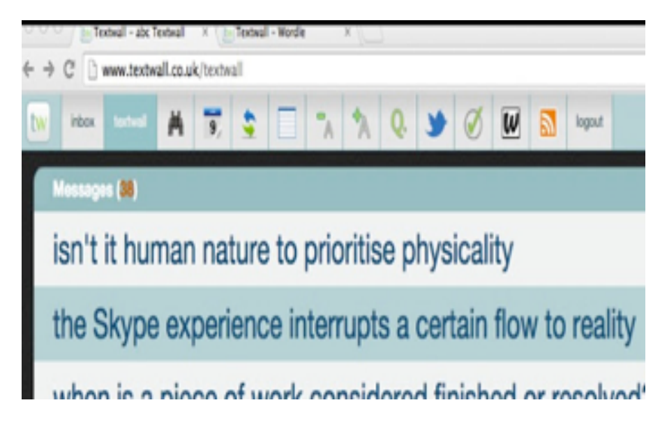
Figure 2: Textwall posting by one of my students: Skype as interruption