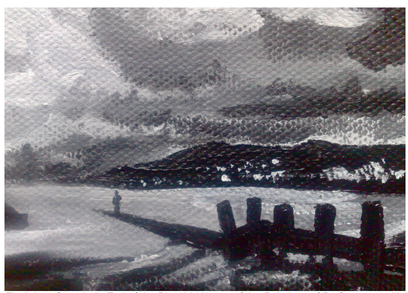
Fig. 2. Lee Campbell. End of the Pier (2010) part of the Paintings of Performances Nobody Saw series. Acrylic on Canvas. 2x3 inches.