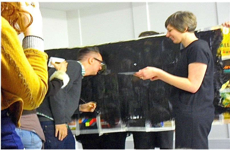
Fig.1. Lee Campbell. Painting the Performance (2011) Courtesy of Becky Cremin.