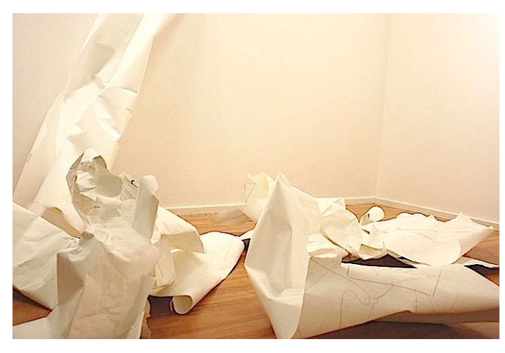
Fig.7. On Your Marks (2011) Courtesy of Coralie Shepphard.