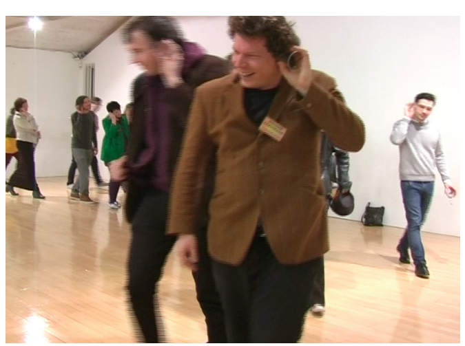
Fig. 11. Lee Campbell Lost For Words (2011) South Hill Park.