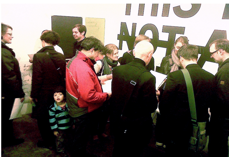
Fig. 8. Witness Statements (2011) Courtesy of the artist.

Despite the amusing comments that participants wrote on their forms, this research highlighted the difficulties of language in constructing meaning to a performance. This was exemplified when I asked the participants to collate their witness statements and choose which statement most accurately represented the performance or, if impossible, to merge statements to produce a collective meaning (Fig.8). As I suspected, meaning construction is entirely subjective to easily produce an overall 'collective' meaning. Groups laughed at and humoured each other's comments on the forms and by the end presented me with statements which contained phrases which had the largest capacity for laughter.