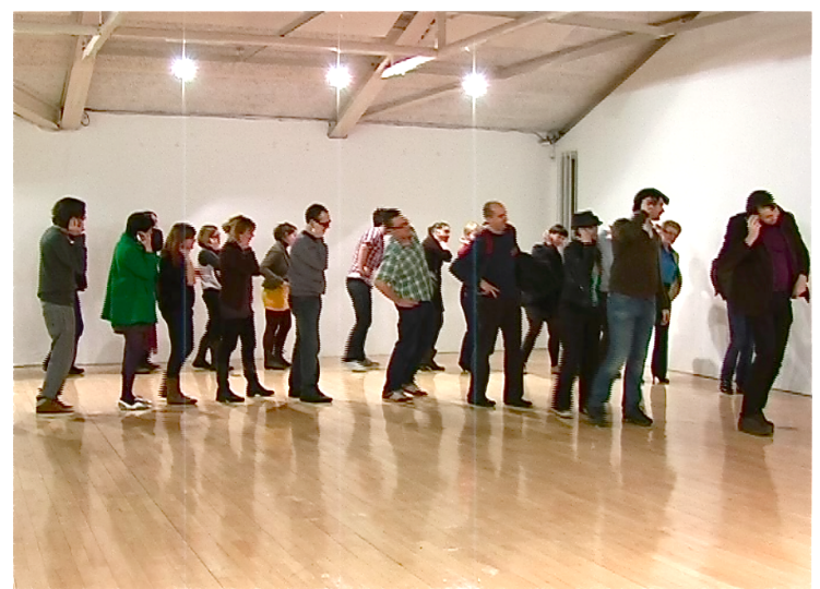
Fig. 9.Lee Campbell Lost For Words (2011) South Hill Park.

will assess how various forms of instruction enable or disable the participant to successfully carry out such inverted behaviour.