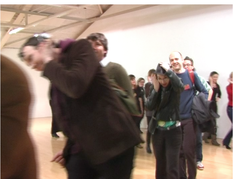
Fig. 10. Lee Campbell Lost For Words (2011) South Hill Park.