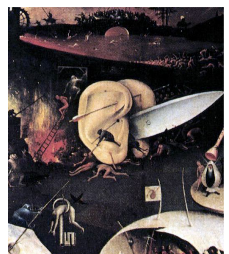
Image 3. Hieronymus Bosch – The Garden of Earthly Delights (probably late 15<sup>th</sup> Century) (fragment)