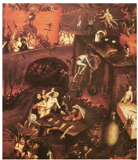
Image 4. Workshop Hieronymus Bosch – Hell (early 16<sup>th</sup> Century) (fragment)

Audience feedback has suggested that Feedback is often experienced as uncanny. Surely, this experience may, to a certain extent, be traced back to the perception of my skin being prodded with metal pins and the intimate sensation of listening to a sound that obviously originates from the inside of my body. However, in accordance with my analysis above, I suggest that the uncanniness of the work may also partially lie in the multiple and fragmented digital representations of parts of my body that the beholder encounters in the work. These virtual manifestations of disjointed limbs and external organs may well manifest themselves in a Lacanian fear of the fragmented body.