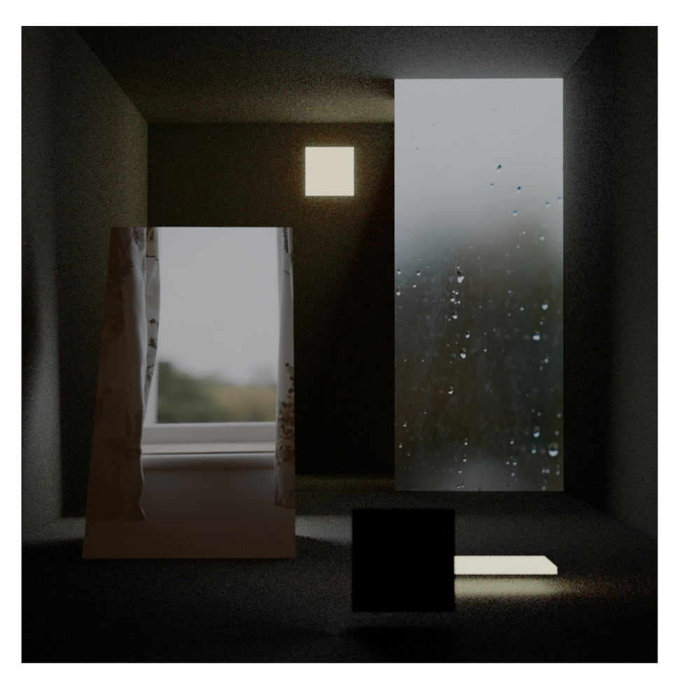
Figure 4: Square Frame experiment v. 2 no. 13.

around images, and the lights reflect toward the inner surface in different rhythms, colliding with the moving image and sound from the off-frame. It embodies sensational and aesthetic phenomena in the situation of being spatialised corporeal and symbolic multimodal modes of communication.