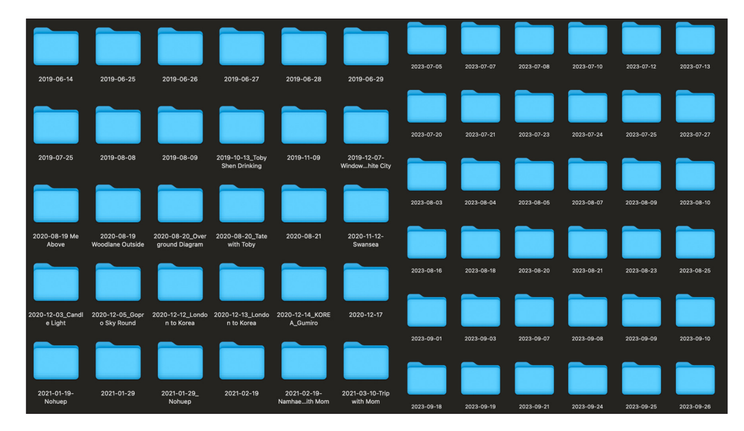
Figure 1: Screenshots of the personal archive.

the dynamic of a space or an object as well as of a subject in imageries that document emotion and sensation. Therefore, the crucial point in editing lies in the fact that how to bring the details of movement to the surface as a documentation of daily life. These details are not what the author finds but, instead, what comes to mind, along with a potentially flowing past.