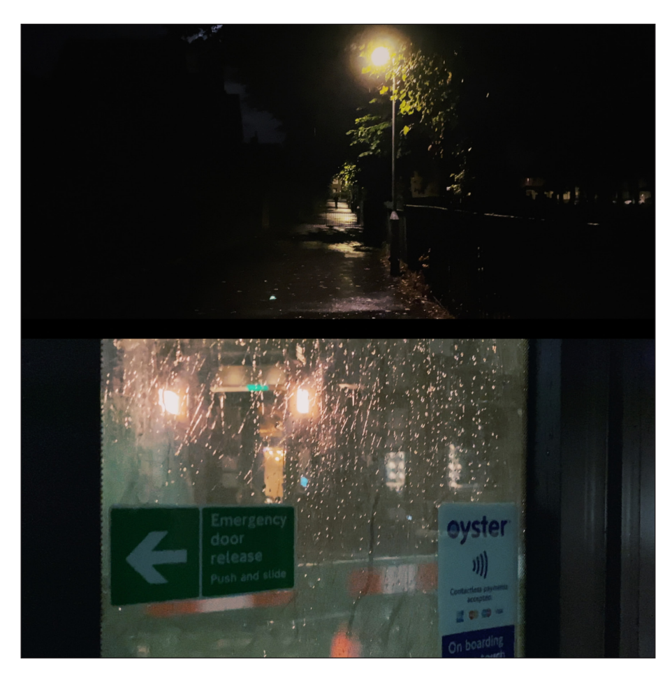
Figure 2: Square Frame experiment no. 3.

For example, in the Square Frame experiment no. 3 ( Figure 2 ), both clips deliver a sense of going back home from different moments of back home . The top video moves inward by the camera tracking the dark pedestrian with blinking streetlights showing the contours of the surroundings. In contrast, the bottom video shows the outside of the bus through the glass, moving from left to right with shops and people passing by from outside of the bus. Both images show different movements unsettling the frame; the black bar in the middle prevents the two frames from merging into a connected one. Thereby, the viewers are not immersed in the frame space but step away and observe the tearing down of the frame space in half in contradictory movements.