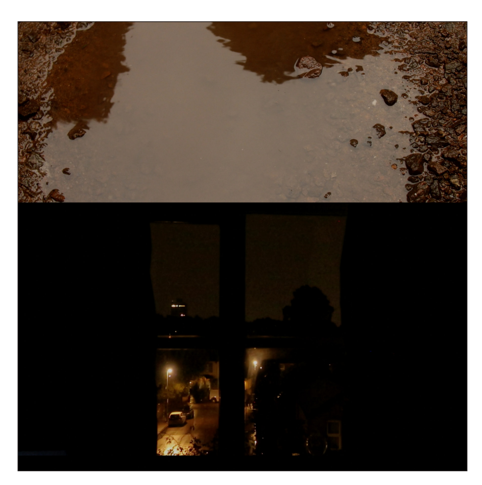
Figure 3: Square Frame experiment no. 20.

is occurring or what lies outside. Conversely, the upper image captures a puddle with water droplets falling, sharing a similar brown spectrum as the bottom image. These two abstracted images hover in space without a connection until the sound of rain from off-frame brings them together. In this image, the sound serves as a third element that bridges the gap in the elusive experience of a peaceful rainy night.